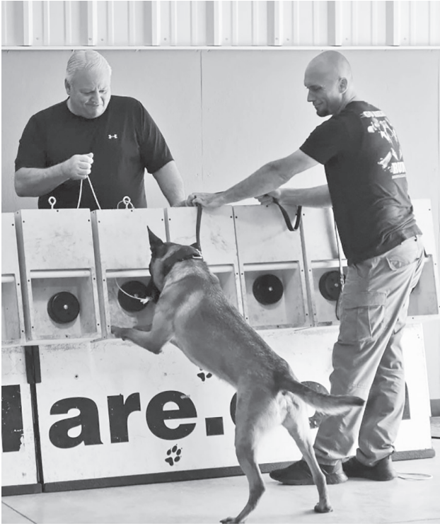
Twenty-two K9 teams recently completed a three-day training session in Indianapolis. A K9 training facility in Hendricks County would benefit all of central Indiana by reducing travel time, costs, and time away from being on the street for officers.