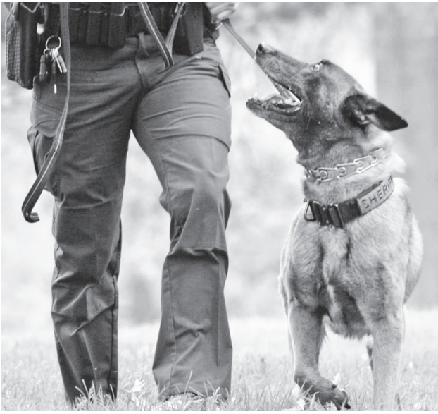
A handler and his K9 develop a bond like none other.