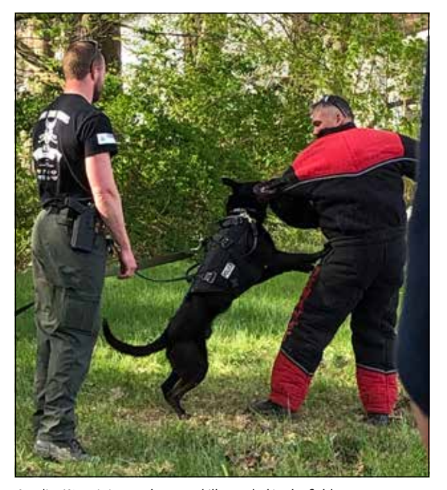
An elite K9 training to sharpen skills needed in the field.

The relationship between the dog and its handler goes much deeper than training and on-the job deployments. The K9s live full-time with their handler creating a true partnership. There is no doubt that these officers of the law